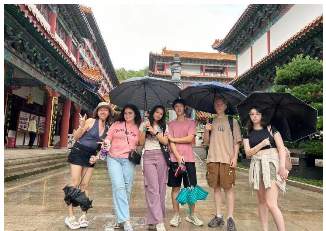
Putuo Temple (Zhuhai) visiting