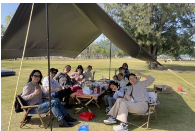
Picnic in Haitian Park