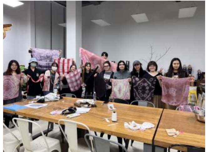
Natural Dye Experiential Workshop