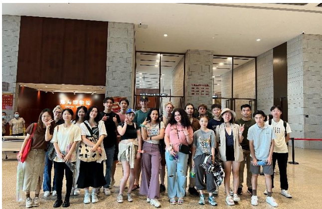
Zhuhai Museum & Zhuhai Planning Exhibition Hall visiting