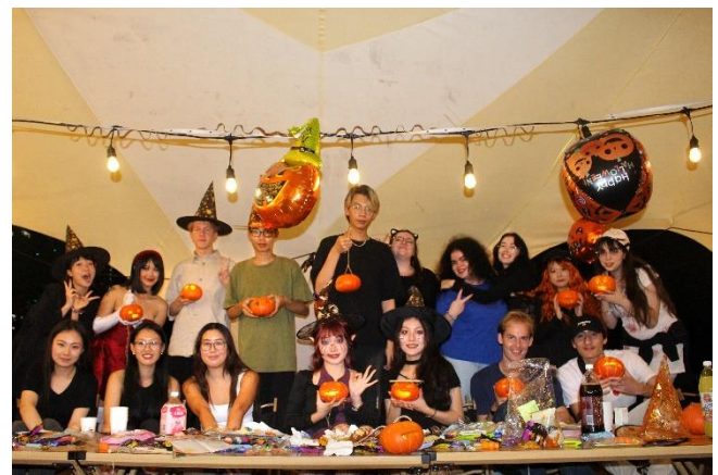
Cross-cultural event: Halloween night