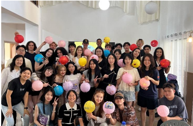
A house party to welcome exchange in and international students and to celebrate the Mid-Autumn Festival together. Making mooncakes, decorating lanterns, doing riddle games, having good food, sharing joyful brand-new chapter of life.

Exchange students will be able join a variety of activities together with all other inbound students: three-day orientation, experiential learning activities, traditional cultural field trips, company visits and Contemporary China lectures as well as cultural sharing workshops.